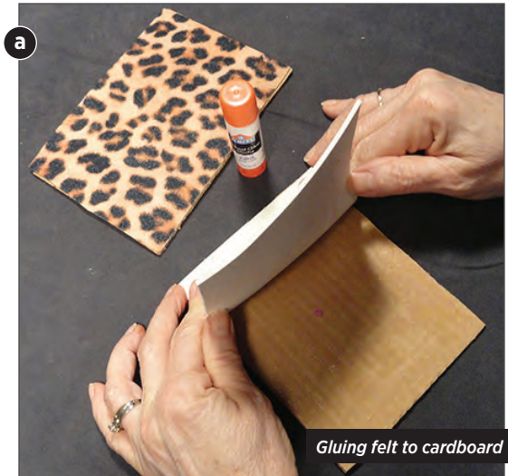
Gluing felt to cardboard

Begin by gluing the felt to the cardboard backing; the felt side is the back of your frame [a]. If you're planning to use magnets to hang your picture, attach them now. Put the backing aside.