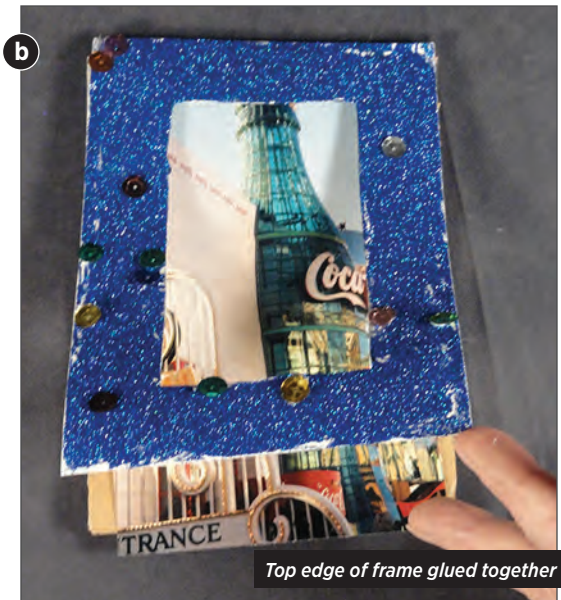
Top edge of frame glued together

This is your chance to polish your frame. Embellishing can add layers to the design or establish a theme for your frame. Beads, ribbon, sequins, jewels, and little toys can be glued to the frame to personalize it. Use stickers, painted stencils, duct tape, or shapes cut from craft foam. Dry brushing paint can add an aged effect. Embellish to your heart's content!