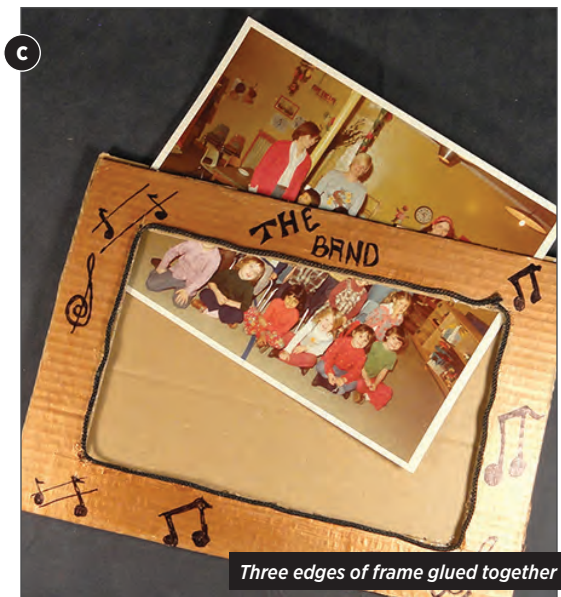
Three edges of frame glued together