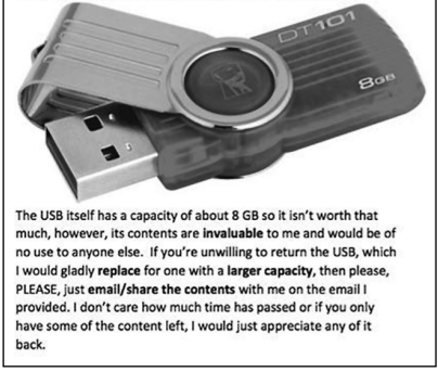
Figure 3.1 Lost USB stick