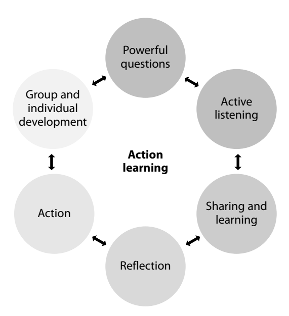
Figure 34.1 Characteristics of action learning sets (NHS Clinical Leaders Network, 2016)